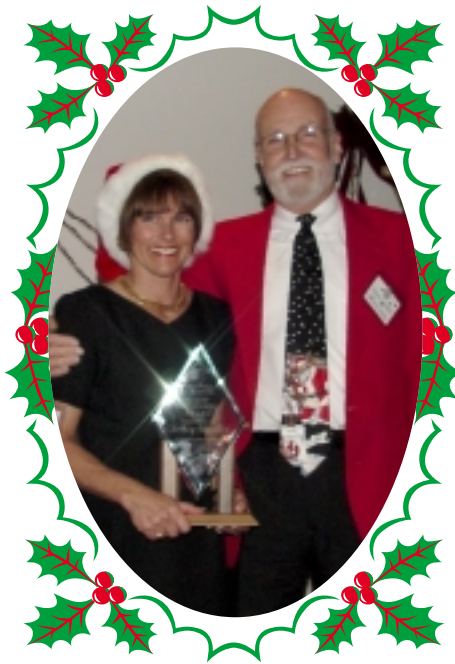
She has a strong belief that the Board is accountable to the membership